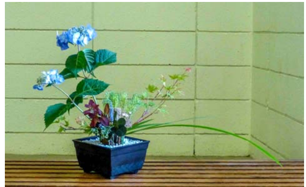
Modern arrangement of kusa materials.