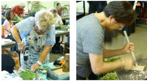
Hard at work creating base structure.