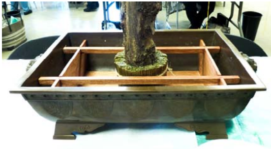
The structure holding the dobuku and komiwara in an antique bronze Ikenobo sunabachi .