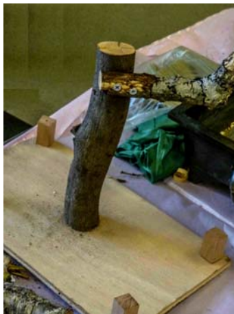
Attaching branches to make the proper yakeda angles.